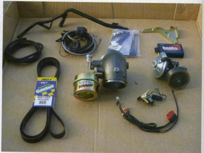
The parts of the Banks Brake kit.

The exhaust brake is actuated by a vacuum pump. A new vacuum pump is a part of the Banks exhaust brake kit. The pump is engine driven and mounted below the CP3 injection pump. The factory serpentine belt is replaced by a new, slightly larger serpentine belt. The electronics are all plug-n-play; no T-taps or soldering are required.