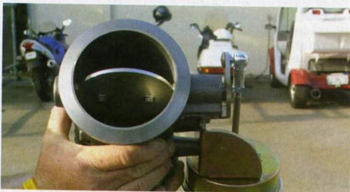
The open/close butterfly

As with most accessories for your truck, the shop you choose to perform the work is the key to which product you choose. I hold Banks products and the Banks organization in high regard.